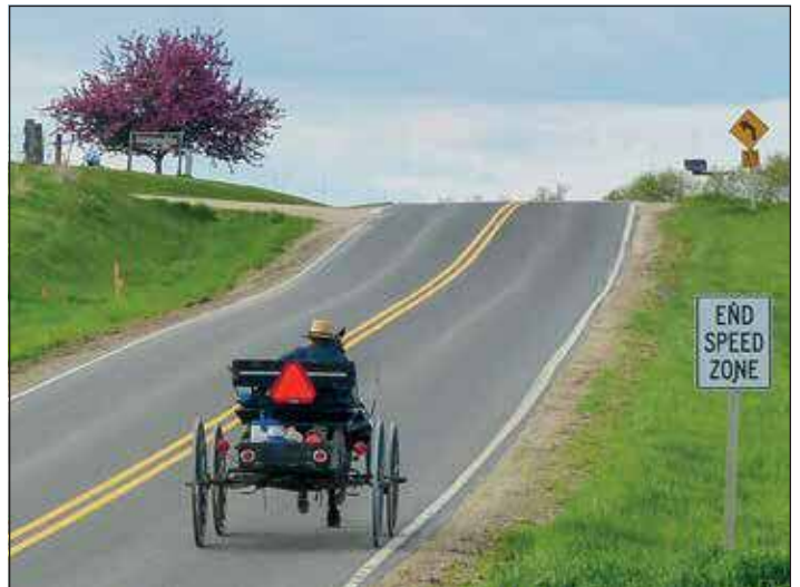
Amish Buggy

You will ride through Harmony, which is also the largest Amish community in Minnesota, with many small Amish shops. Not just shops, but also restaurants with great food and large portions. This is a good place to stop for lunch. You will also want to watch for the Amish buggies on the road. The buggies are all black, and most of them will have a bright orange triangle sign on the back. But, then there are some Amish people that do not believe in the signs, making them harder to see. Be careful.