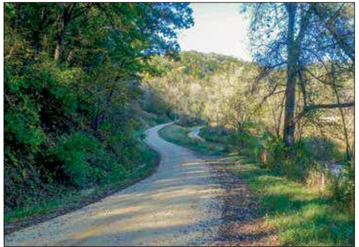
Rush Creek Road.