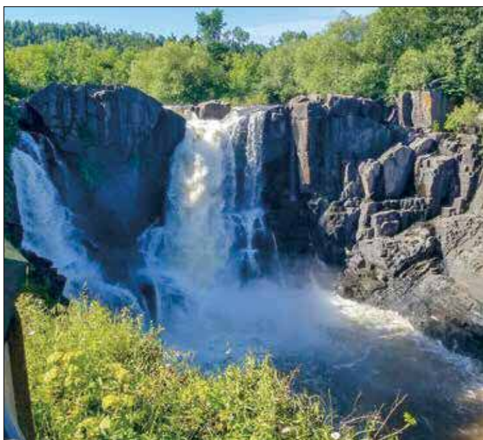
Waterfalls on Pigeon River

If you continue north along what is known as the North Shore, which is actually the north shore of Lake Superior, aka "Gitche Gumee." The road starts in Duluth as a 4 lane divided highway with a speed limit of 70mph. The further north you go, the speed limit goes down and the road turns to a two lane road along Lake Superior. Eventually it will be down to 55 mph and some places have a 40 mph limit. It is a great road to view the Lake with the many rivers flowing into it, as you