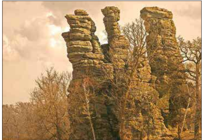
Scenery near Viroqua

As you leave La Crosse and the river valley you will take the many turns and curves through this valley area. This may be a US Highway, but that does not mean it is flat or straight. It has long sweeping curves as well as some changes in elevation as you ride through the valleys. The further you ride away from La Crosse, the more farmland you will see, but not large fields. The hills and valleys dictate the size of the fields as well as you will see where many farmers have terraced the hillsides to help eliminate erosion.