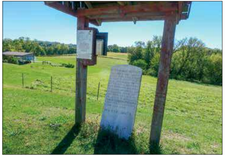
Black Hawk marker.

Now, drop down to town of De Soto (gas) on the river and pick up the Trans WI. Cross over a ridge and drop into the Rush Creek Valley and wind your way on a scenic gravel road to the headwaters.