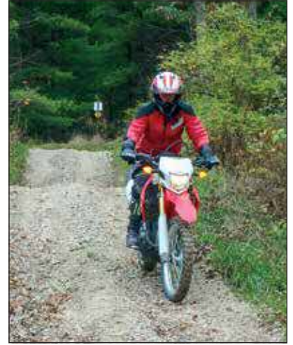
Exiting Trout Valley trail.

Next up is a tour on the valley parkway of the Whitewater Wildlife Management Area. Slow down and enjoy, lunch is not far. Exit the valley and pick up another MM road before turning onto the highway to Plainview. Find Cabin Coffee (Subway and motorcycle shop in town) at the main crossroads, drop the side stand and enjoy the relaxing ambience and a sandwich.