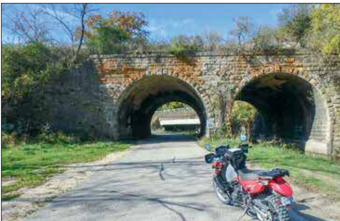
The Arches railroad bridge.

Depart the mill and pick up more gravel, more ridges, and more valleys. Soon, you'll enjoy another MM road that drops down to an imposing double-arch railroad bridge, built in 1882 and known as The Arches. Take a moment to ponder the construction with locally sourced limestone (as with the mill) and the point of view as the historic arches present a binocular framing of a contemporary highway bridge.