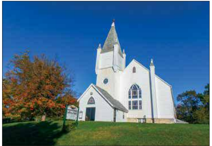
South West Prairie Lutheran Church.

Turn to the north and pass the postcard perfect white Lutheran church, built in fine Norwegian-prairie architecture, and enter an Amish settlement.