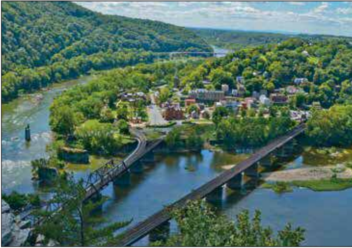
Harpers Ferry

This is just a sample of the sites that can be seen along this route. For more details, ask at the Registration desk.