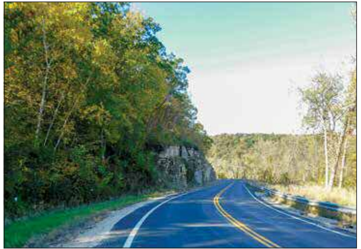
Near Rushford, Compliments of Carl Wieman. This road is known as the Historic Bluff Country Scenic Byway.

This is a smooth flowing route with easy riding twists and turns until you get about 30 miles from the start. When you reach Rushford, the route will cross the Root River to the north side and then back to the south side after a few miles. This is where you get into some very twisty areas for many miles. The twisty sections on this route are not real challenging, more of the fun type.